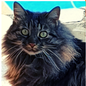
Fluffy the cat