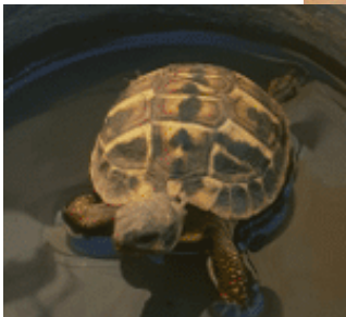
Machouille the tortoise