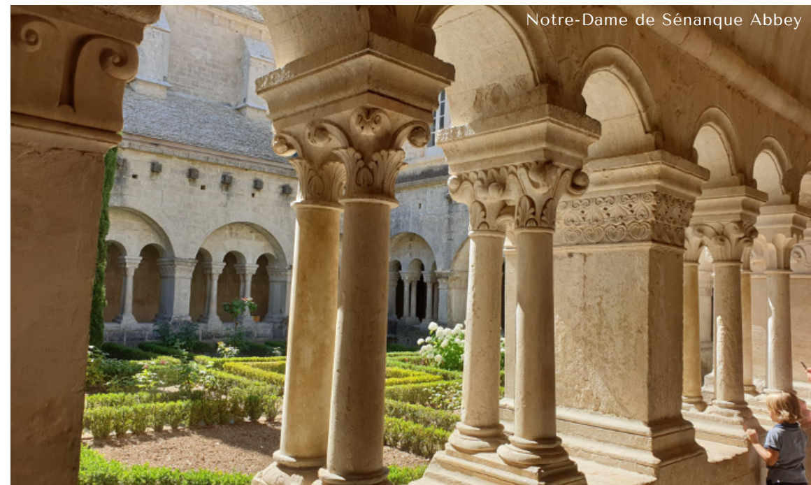
Notre-Dame de Sénanque Abbey