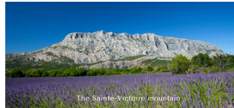
The Sainte-Victoire mountain

Provence is one of the most popular regions in France due to its unique location, sunny weather, blue skies and varied landscapes: its Mediterranean coastline, mountains - the most famous being La Sainte Victoire, so beautifully depicted by Cezanne -, its pine and oak forests, and numerous typical villages and animated cities, all within accessible distance from Ventabren.